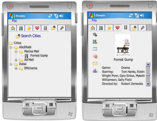
Fig. 3 Search cities and movie information snapshots

We have implemented most of the system features such as search cities, search movies, user bookmarks, user cinemas, movie premier, stream movie trailer, movie details, movie schedule time, offline access to the application, buy tickets, tell friend about movie and rate movie. Fig. 3 shows examples of some implemented features.