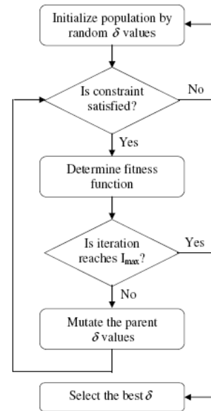
Fig. 1 EP steps for determining the optimal \delta

The core of the proposed approach is to recognize the optimal modulation index \delta for the FM signal, which is generated for the pulse train so as to drive the ballast operation. The modulation index decides the range of frequency to be deviated in the FM signal from the carrier. Hence by using EP, the optimal \delta is determined and the steps for determining the optimal \delta are depicted in the Fig. 1.