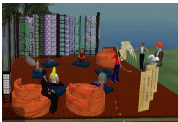
Fig. 1 Avatars in a 3D space engaged in a philosophy and ethics discussion.

worlds support the creation of constructivist learning environments ; [8], [10]. Research into purely text-based virtual worlds has found they too can 'promote an interactive style of learning, opportunities for collaboration, and meaningful engagement across time and space, both within and across classrooms' [11]. Visual representations of 'in-world' activities supply have additional affordances which support a constructivist paradigm of learning and 'highly cooperative learning activities' [6].