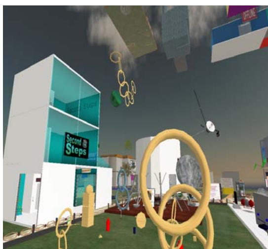
Fig. 2 Schome Park's area for carrying out physics experiments.