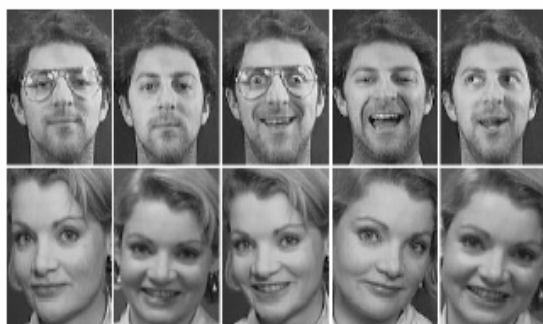
Fig. 3 Sample images obtained from ORL database

pattern with 40 classes. Moreover, comparison with other known results on the same database. Table V shows a summary of the performance of various systems for which results using the ORL database are available. The proposed method showed the best performance and significant reduction of error rate (44.7%) from the second best performing system—convolutional NN.