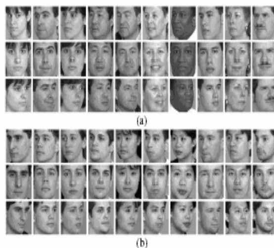
Fig. 4 Examples of (a) training and (b) test images

Reference [77] describes an approach for the problem of face pose discrimination using SVM. Face pose discrimination means that one can label the face image as one of several known poses. Face images are drawn from the standard FERET database, see Fig. 4.