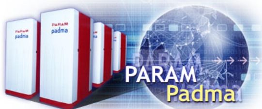
Fig. 2 Picture of C-DAC's Tera-Scale Supercomputing Facility (CTSF)