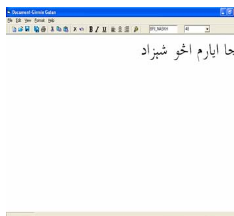
Fig. 3 Burushaski Editor

Unicode has made possible to develop Multilanguage text editor for Burushaski and Urdu. The basic purpose of this editor is to automate Burushaski language and preserve this ancient heritage. Urdu users can also use it to compose their text, as Burushaski has all Urdu alphabets and properties, plus some extra alphabets and extensions. Multilanguage text editor for Burushaski and Urdu created with the help of Unicode and Unicode based open type-fonts. Since many alphabets are totally unique in Burushaski, so Bki Naqsh fonts are created for this language.