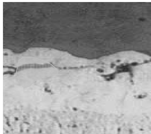
Fig. 2 SEM structure of TBC specimen