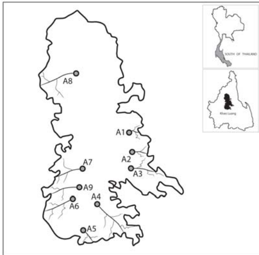
Fig. 1 Nine waterfalls at Khao Luang National Park. (A1-A9) represent waterfalls. A1: Ai-kaew; A2: Wangmaipak, A3: Promlok; A4:Kralom; A5: Thapae; A6: Suankun; A7: Huafa; A8: Suanhai; A9: Soidaw