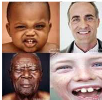
Fig. 1. Samples from training data.

The initial training of the Gaussian components is carried out using a data set of skin color pixels that includes 127,352,563 pixels. The training images have cautiously been selected to cover almost all ethnic groups and imaging conditions. The training images were manually segmented before parameter estimation. Figure 1 shows a subset of the training images and Figure 2 shows them after being manually segmented. The color space used is YCbCr. To reduce the effect of illumination, Y channel has not been considered through out the segmentation process. We start the initial EM stage with five components. This assumption is based on our intuitive classification of the skin samples using their appearance color. The second stage of EM algorithm tries to optimize the number of components. According to the results of this stage, the optimum number of components is seven. The adaptive algorithm uses the results of this stage for segmentation. Figure 3 shows a sequence of frames indicating changes in lighting condition. Some pixels from the first frame have been