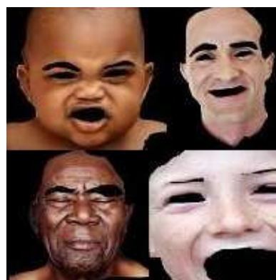
Fig. 2. Manually segmented training data.

compared to their correspondences in the last frame in the sequence given in frame 3. Four small regions have been