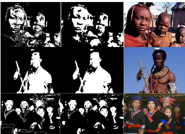
Fig. 4. Skin color regions segmented using non-adaptive GMM (left), proposed method (middle), and the original image (right).

An adaptive skin color segmentation algorithm based on Gaussian Mixture Model (GMM) has been proposed which can adapt the model parameters to cope with the changing imaging conditions such as lighting and noise. The algorithm considers the higher level a-priori knowledge of spatial and temporal relationship between the pixels in a video sequence. The experimental results show the superiority of the proposed algorithm compared to non-adaptive parametric models. Further improvement can be achieved by incorporating application specific information such as human motion models or face-hand detectors. The proposed method may also be used in surveillance systems and motion detectors.