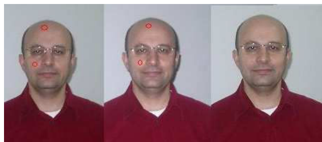
Fig. 3. A video sequence with changing lighting condition.

compared to their correspondences in the last frame in the sequence given in frame 3. Four small regions have been