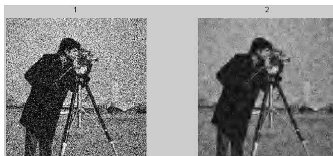
Fig. 5 1. Degraded image (blur + noise) 2. Multiscale Blind image restoration

In the pervious test no blur was added to the original image, our second test consists of an image cameraman of size (256 \times 256) . Suppose PSF is a Gaussian blur with variance 0.02 to a support of size (9 \times 9) . The blurred image was obtained by convoluting the original image and the PSF. Gaussian, zero mean noise is added to the blurred noise. The proposed algorithm derived in section 4 is used to this test and the results are shown in Fig. 5.