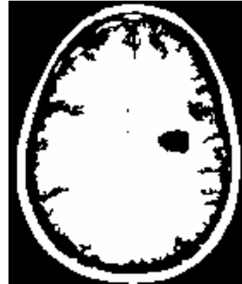
Fig. 1 (b) Magnetic Resonance (MR) image of the brain after applying Fuzzy Kohonen neural network