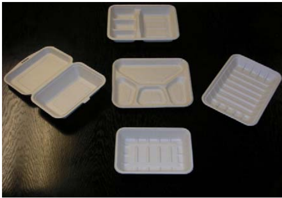
Fig. 5 Variety of shapes of packaging units made of EFB