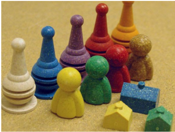
Fig. 1 Uses of Biocomposites

natural polymer. In the contemporary scenario, due significance has been provided to synthetic and fossil derived polymers which may be either virgin or recycled.