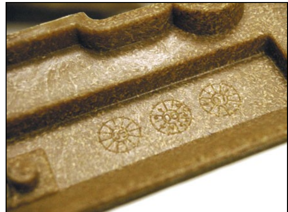
Fig. 4 Embossing on the Biocomposite

If longer fibers are desired, then flax, hemp, kenaf and cotton can be mixed with fibers of thermoplastic polymers. Subsequently, this is hot pressed to form the thermoplastic fiber for forming the composite. In this manner, thermal insulation can be improved with Biocomposites which can be valuable in reality sector as part of carbon efficient housing.