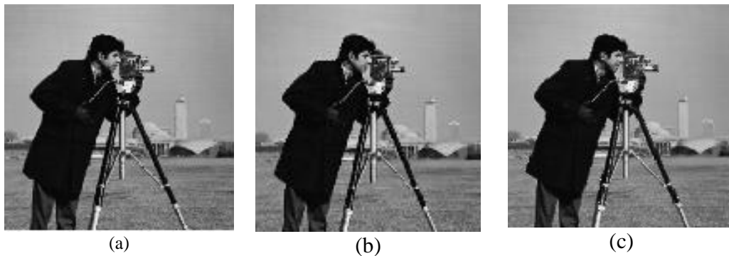
Fig. 3 Reconstructed images of Cameraman by (a) proposed method with fuzzy logical bit block (b) conventional BTC (c) ABTC with 16 predefined bit planes.