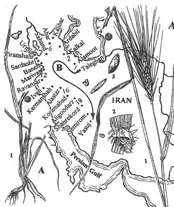
Fig. 1 The path and areas where the plant was studied in Iran

Through the paths from Taleghan (located on the Northwest of Iran; habitat N° 1) to Yasuj (located on the west of Iran; habitat N° 100) one hundred habitats (populations) of the T. boeoticum , selected and marked (Fig. 1). According to the climatograms, these habitats were ordinated from cold to very cold; always in boundaries between arid to humid areas [10].