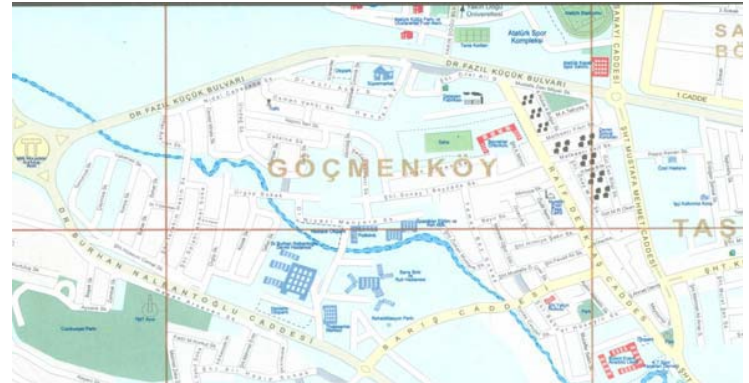
Fig. 1 Map of Göçmenköy district

The map of the Göçmenköy district and the divided districts of Nicosia Municipality are given below in Fig. 1 and Fig. 2.