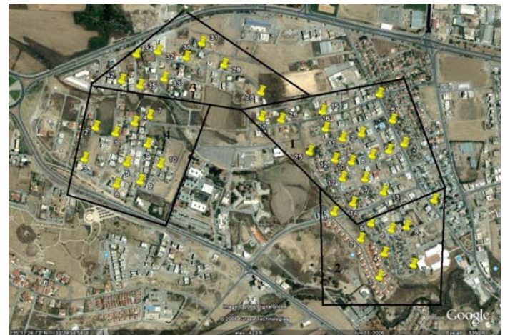
Fig. 2 Divided districts of Nicosia Municipality

The present system could be viewed as a network with undirected arcs and nodes. Every arc has a weight attached to it, and it is often possible to get from one node to another in more than one ways. Thus, if there are n nodes in a network, there must be at least n-1 arcs that are needed to connect all the nodes with one another. The basic algorithm that will be used over here is as follows: