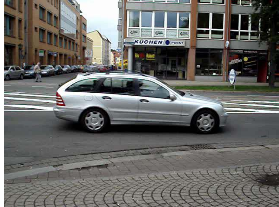
Fig.3 Authenticated frame using the proposed technique. Correlation coefficient=0.9998, PSNR=46.64 dB.

Assume that an attacker removes an object from the authenticated video and places, instead of the removed object, adjacent blocks coming from another authenticated area. Fig. 2 is the original frame and Fig. 3 is the authenticated version. The computed peak signal to noise ratio PSNR and correlation coefficient between the original and authenticated frames are 46.64dB and 0.9998, respectively. In Fig. 4, the car object is removed and precisely replaced by a background coming from another authenticated frame without introducing