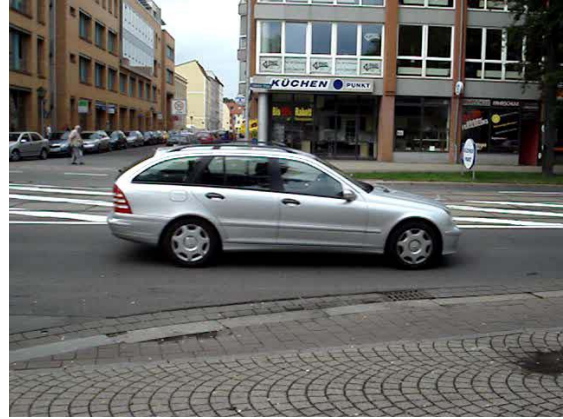
Fig.2 Original frame.

coming from different frames regions. Thus, we will consider an example to demonstrate the performance in case of a large region in a frame coming from another authenticated frame (we can repeat this case for many frames). We use RSA as a public key algorithm and SHA (Secure Hash Algorithm) as a hash function. The used block size is 8 \times 8 and two LSB plans are exploited for embedding blocks descriptions and signatures copies. We applied the proposed algorithm on the three channels of the test video which has 480 \times 640 frames.