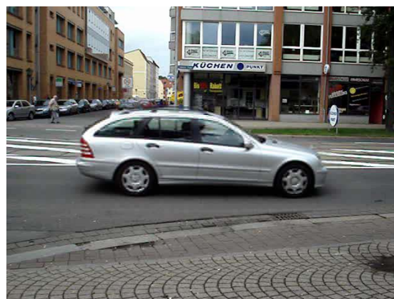
Fig. 6 Verification result reconstructing the altered blocks. Correlation coefficient=0.9939, PSNR=33.15 dB.