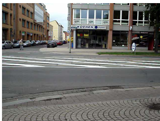
Fig. 4 Altered version of the authenticated frame.

A novel public key self-recovery video authentication technique is proposed. The proposed method is not only capable of localizing the alteration detection but also capable of recovering the missing contents with high reliability using multiple description coding. Furthermore, the proposed technique thwarts VQ attacks using a multiple links chain to securely embed the block signature copies into several arbitrary-distant blocks. Public key algorithms are utilized for guaranteeing the security and permitting anyone to test the authenticity of a given video.