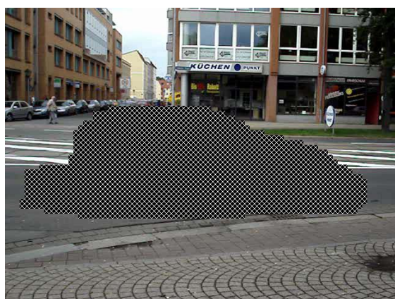
Fig. 5 Verification result marking the altered blocks.