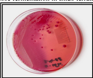
Fig. 2 Rose colonies in agar McConkey typical for E. coli

For Salmonella spp., initially was preceded with the burning of surface organs taken from carcasses with a spatula and then their surface cutting was carried out with scissors in the cube form. The cutting pieces were inoculated in growth and differentiating endo, blood agar and broth terrains and then placed to be incubated in a thermostat at 37 ° C for 18 - 24 hours. After incubation in broth, a diffuse increase was observed: in blood agar was shown small grey shiny colonies, which were of type S; while in differentiating Endo terrain, salmonella colonies were small, smooth and with color of the respective terrain. Agar Mc.Conkey is inhibitory terrain for non enteric microorganisms. Their cultivation in this terrain made possible the differentiation of microorganisms that ferment the lactoze by microorganisms that do not ferment the