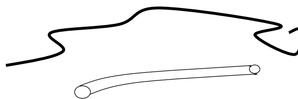
Fig. 2 The thread deforming in a three-dimensional space and its idealization as a one-dimensional rod-like structure.

The finite element meshing can be adjusted to emphasize the type of output desired. Meshes can be static (i.e. meshes that do not change), dynamic (i.e. changing meshes) or a combination of both. Examples where static meshes can be used are for closure of tissues while dynamic meshes are more appropriate in case of tissue cutting. On the other hand, the mesh needed to discretize the surgical thread must be very fine and the large number of material parameters at each node becomes cumbersome for real-time interactive simulations. One interesting approach to decrease the computation time is by Berkley et al. (2004) [24]. To solve for the deformation of the thread, a classical finite element analysis is implemented but the output is determined on a "need to know basis". The underlying idea is that only a selected number of variables, not all, need to be computed. For instance, it may not be necessary to calculate the displacement at some interior points, nor may it be worthy to know the stress or strain field at these particular points. In the same spirit, reaction forces need to be only computed when the user touches the thread. Real-time aspect of the simulation is even more important when simulation knot formation since a skilled surgeon will be able to tie five to eight knots per minute.