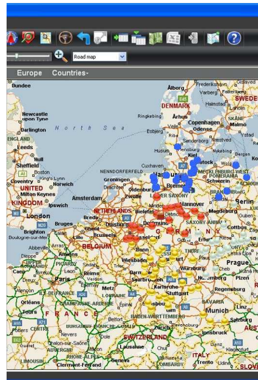
Fig. 3 Prototypical implementation