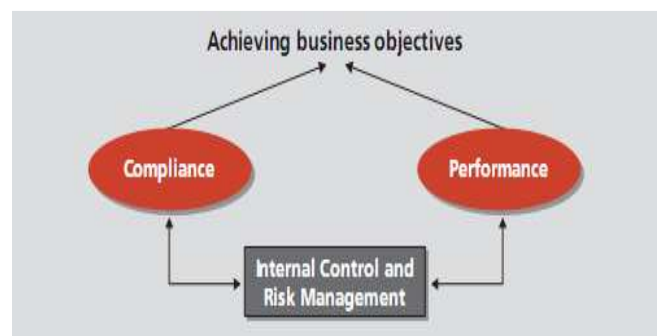
Fig. 1 Internal control framework

Internal control is fundamental to the successful operation and day-to-day running of a business and it assists the company in achieving its business objectives. As indicated above, the scope of internal control is very broad. It encompasses all controls incorporated into the strategic, governance and management processes, covering the company's entire range of activities and operations, and not just those directly related to financial operations and reporting. Its scope is not confined to those aspects of a business that could broadly be defined as compliance matters, but extends also to the performance aspects of a business. (Figure 1)