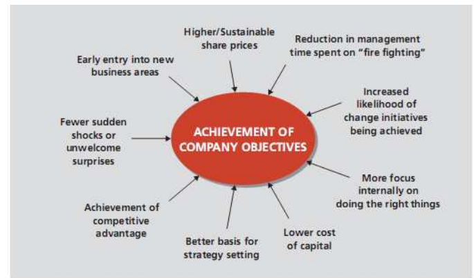
Fig. 4 Potential benefits of effective risk management and internal control

In the business world, a company's objectives and the environment in which it operates are continually evolving and, as a result, the risks that it faces also change. A sound system of internal control depends on a thorough and regular evaluation of the nature and extent of the risks to which the company is exposed. The systems and processes of control need to be sufficiently flexible to be able to change and adapt as the environment and the company's organization, objectives and activities develop over time [16].