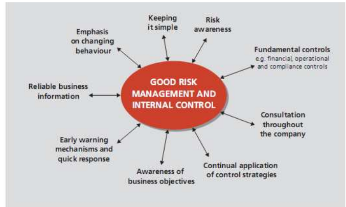
Fig. 3 Fundamentals of good risk management and internal control

events. The board must determine the type and extent of risks that are acceptable to the company, and strive to maintain risk within these levels. Internal control is one of the principal means by which risk is managed.