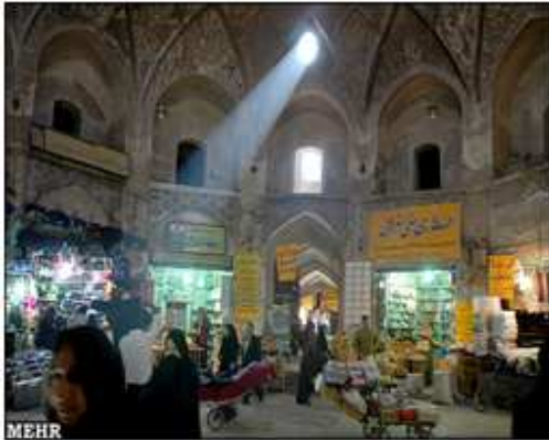
Fig. 4 Small Bazar

Small market (with limited area forms sometimes along a linear axis and sometimes around a local square)