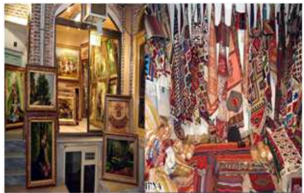
Fig. 12 Handicrafts