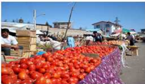
Fig. 5 no ceiling Bazar

Regarding the numerous climatic conditions of Iran, architecture and the climate of Iranian markets have led to variety of the form of structure of these buildings. The main differences could be seen in the difference of the ceiling height (short ceilings in mountainous cold regions and tall ceilings in hot and dry regions), or in the form of ceilings (arc and dome in hot and dry regions and cold mountainous regions), planar (in hot and humid regions) slope ceiling (in humid and mild regions) and even in some cases with no ceiling [3]