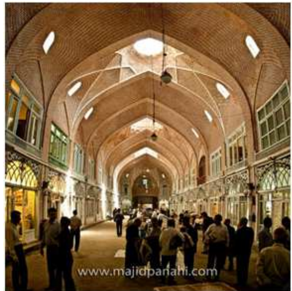
Fig. 6 Rasteh Bazar