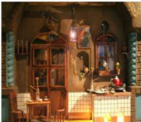
Fig. 10 Centers for entertainment