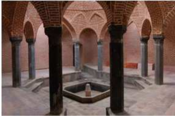
Fig. 8 Public bathrooms