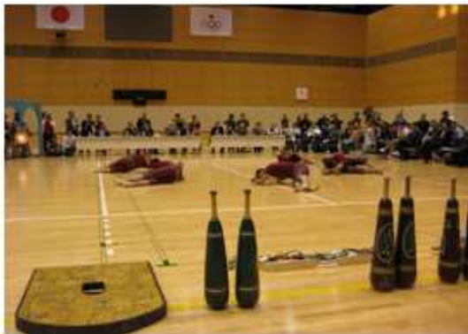
Fig. 9 Zoorkhaneh