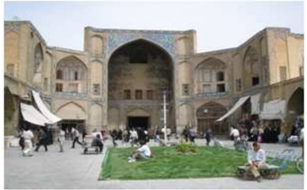
Fig. 11 Valleys and gates