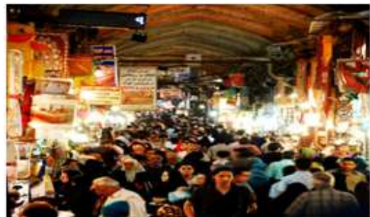
Fig. 2 Cross or junction Bazar

Cross or junction markets (in the form of crusade, which consist of two vertical axes)