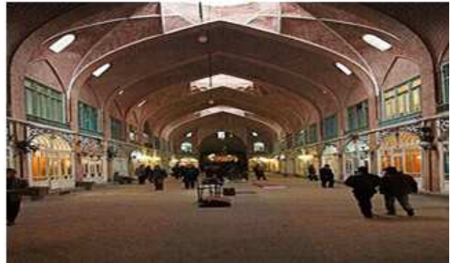
Fig. 1 Longitudinal Bazar

Undersigned or irregular expansion (no thinking and based on the need of the time) and organic (automatic) [1] Longitudinal or linear markets (form along with an axial passage in the form of corridor. Multi-axial markets (like an extensive market of parallel and junction passages with several axes)