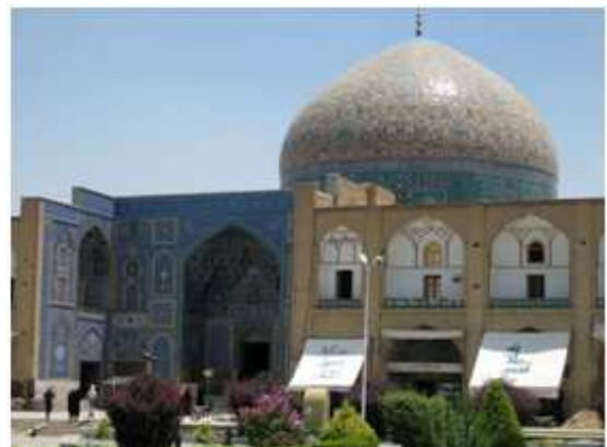
Fig. 7 mosques