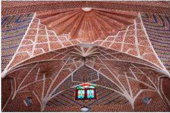
Fig. 13 Bazars architecture

Here the market space is influenced by the religious beliefs and is the spatial manifest of the community world outlook, which demands freedom in selection, avoiding trick and hypocrisy and choosing the bests. This thought gives the purchaser the power of comparison, choosing the best and purchasing at lower price, devoid of any fault and proportionate to its power. The structure of traditional markets is representation of genuine Iranian art. The Iranian art tries to manifest the unity of creation in the multiplicity and plurality of the creatures and in fact deals with the monotheism. In the Iranian art, motion toward joining the eternity is quite evident and move toward the heavens joints the materials and morals with precision and stability. The art of Islamic Iran is the manifest of faith to the divinity, and this art could be exactly observed in the heart of our cities, namely market. The Islamic arts with abundant time-place intervals have a unit and inseparable spirit, which is the spirit of stability in creation of buildings. This spirit of unification in architecture [7]