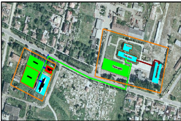
Fig. 1a. The evacuation concept (the evacuee's reception center, the mobile medical point and the accommodation center)

schematically presented in Figure 1a (the evacuee's reception center, the mobile medical point and the accommodation center) and Figure 1b.