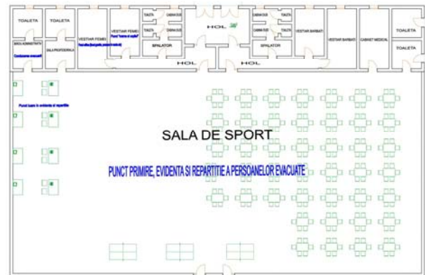
Fig. 2 .The way a sport hall have been organised to

The general architecture of the integrated decision support system for emergency management has been detailed in [6] and showed on the Figure 3.