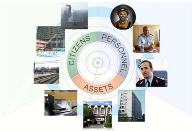
Fig. 1b. The evacuation concept

Relying on the Dutch model, the evacuees were directed the evacuees reception center - ERC which was organized in a sport hall. This solution was chosen because there are buildings of this type in many urban or even rural locations, which allow the temporary sheltering of a great number of people and the playing area can be easily organized into specific areas. At the same time, the vestibules and other annexed spaces can have specific purposes, such as: resting areas for pregnant women, a medical office or "mother and child" rooms (Figure 2).