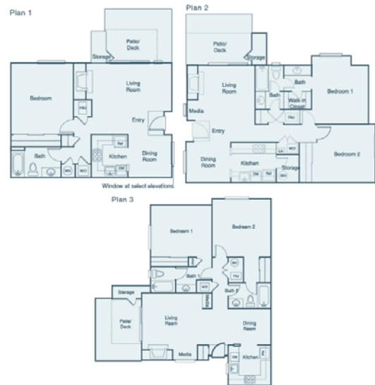
Fig. 2 Floor plan of the Bishop-Ranch