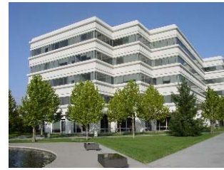
Fig. 1 The building of the Bishop-Ranch

In order to supply complete control on the construction method, the park has set the principles of the exact urban design containing the situation and limitations of the constructions and this park has been established in an area about 585 acre (see fig.1 & fig.2).