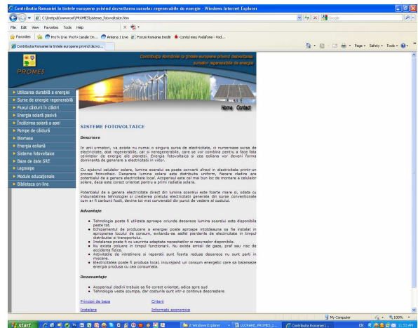
Fig. 2 – PV Systems

A module section covers the following topics: heat loss, passive solar techniques, solar water heating, heat pumps, biomass for heating, wind energy, and photovoltaic cells (Fig. 2).