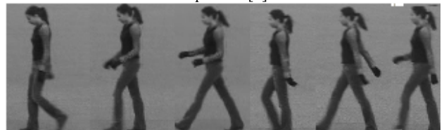
Fig. 2 Sample images from multiple frames of a single person's walking sequence [2]