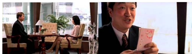
Fig 1 A male client expressing a negative opinion on divorce (left) and reciting Xiaojing and Lunyu (right)