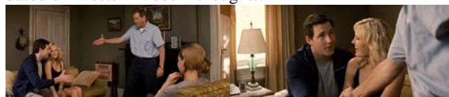
Fig 15 George meeting Tess' father (left) and George shaking hands with Tess' father (right)

Tess invites George home in order to introduce him to her father. A friendly mood is created as the father expresses his thanks to George and shakes hand with him for giving a job to Jane and marrying Tess. The two families meet each other on an equal position rather than on hierarchical human relation based on Western modern thoughts.