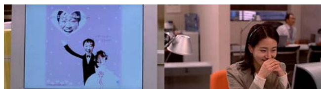
Fig. 2 E-invitation card sent by a male client (left) and Hyojin happy with the client's wedding (right)

after the meeting. The client invites using an email (e-invitation card) instead of sending a traditional invitation card according to Eastern proprieties. The simple and convenient invitation may be considered an example of remediation resulting from the mixture of invitation card, a traditional medium, and the advance of sociality, culturality and technology.