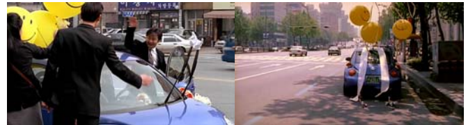
Fig 5 Jeongmin leaving for a honeymoon (left) and the rear of Jeongmin’s wedding car (right)

The friends decorate the bumper of the car for the honeymoon tour with tin cans connected by string or write messages on the car using a lipstick. These practices are also Western wedding culture announcing that they are newly married couple [11]. We can see such western traditions in Jeongmin’s wedding car.