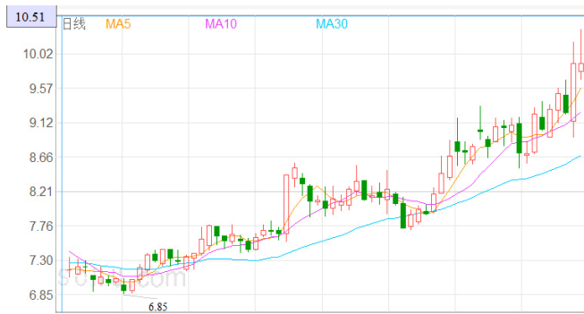
Fig. 3 The Stock Price of Company X3

In a word, dynamic fuzzy clustering analysis of real estate companies is with good precision above, and it's valuable to grasp the investment opportunity and so on.