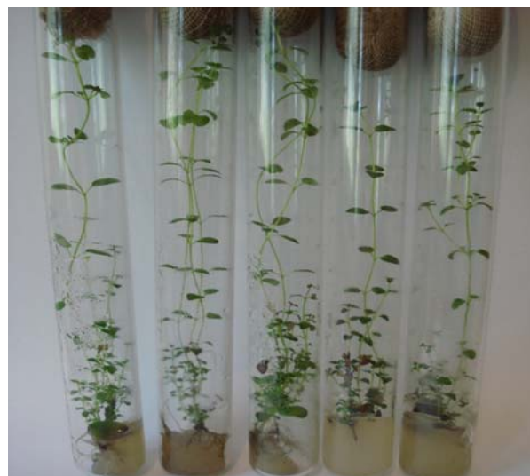
Fig. 1 Micro-plants of T. serpyllum L. on 1/2MS medium containing 0.1mg/l IBA

For further in vitro micro-propagation the explants of 0.4-0.5cm length were planted in ½MS medium containing 0.1 mg/l IBA. Root formation was recorded after 7-10 days. Micro-plants were obtained after 28-30 days, multiplication factor of which was 1:5. During the obtainment of the initial plants, the clonal micro-propagation method with activation of axillary buds was used, which was based on the removal of apical domination. The selected test tube plants were further propagated by micro-cuttings. The subculturing was done again in MS medium supplemented with 0.1mg/l IBA. It was found out that the micro-propagation of test tube plants in in vitro culture can be held throughout the year. But the best period is from spring to autumn. After 7-10 days rhizogenesis of explants was 98-99%. The length of micro-plants was 7-8cm after 28-30 days and the multiplication factor from one micro-plant was 1:6 (Fig 1).