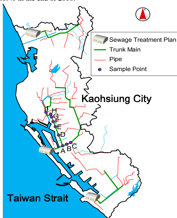
Fig. 1 Kaohsiung City sanitary sewerage and nine sample points [4]

Kaohsiung City is a coastal city with a population of about 150 million and becomes the transportation and commercial center in southern Taiwan. Besides, five industrial zones, two export processing zones, and other several important factories such as Taiwan Steel Corporation, Taiwan International Shipbuilding Corporation and Chinese Petroleum Corporation etc. turn Kaohsiung City into an industrial center as well. However, accompanying with the rapid development of Kaohsiung City, environmental pollution seriously affects the life quality of the residents. Before 1989, the domestic sewage and industrial wastewater directly or indirectly discharged into the river and threaten human and environmental health because the sewage connection rate in this city was only 6.5%. Therefore, at that time the Kaohsiung City Government launched the Kaohsiung City sewage system, which is shown in Fig. 1. The sewage connection rate in this city was upgraded to 60.89% in the end of 2010.