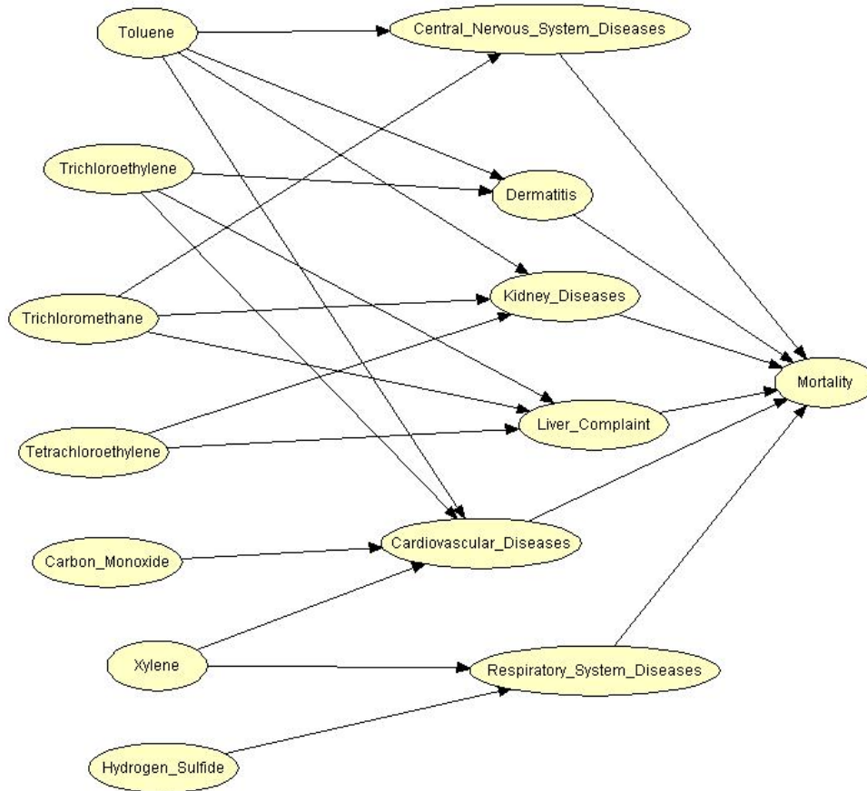
Fig. 2 BBN-HRA structure for hazardous substances in sanitary sewerage