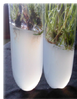
Fig. 2 Root induction in the in vitro shoots of java vetiver

Almost all (90%) of plantlets were survived during acclimatization in husk charcoal media (Fig. 3). Husk charcoal is suitable for plant acclimatization media, because it can absorb and maintain water availability in the media, inhibit the growth of pathogenic organisms, show good aeration and drainage and fix toxic substance [21].