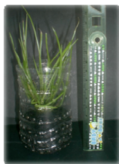
Fig. 3 Acclimatization of plantlet in husk charcoal media